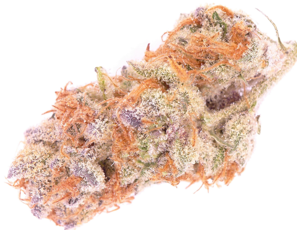
Sample Photo: Ocean Fruit 315 LED

Results valid for sample tested and metrologically traceable to an SI unit. LOD = 0.0433 ug/mL, LOQ = 0.2164 ug/mL or better. Values are presented by weight per cent within an error of 4.5% of the reported value with 95% confidence. Sampling per 16 CCR 42 Article 3, if required. Report shall not be reproduced except in full, without written approval from Coastal Analytical.