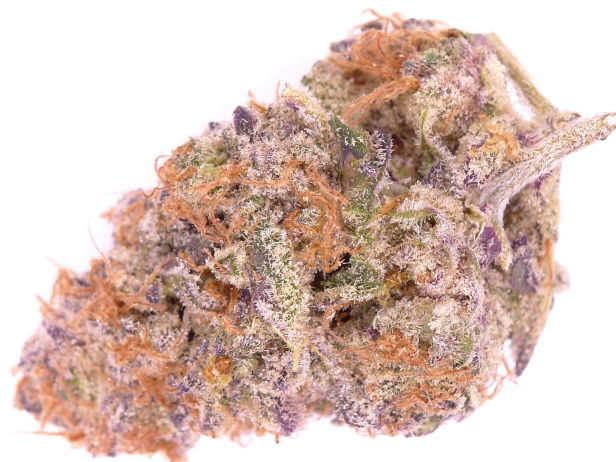
Sample Photo: Ocean Fruit LED

Results valid for sample tested and metrologically traceable to an SI unit. LOD = 0.0433 ug/mL, LOQ = 0.2164 ug/mL or better. Values are presented by weight per cent within an error of 4.5% of the reported value with 95% confidence. Sampling per 16 CCR 42 Article 3, if required. Report shall not be reproduced except in full, without written approval from Coastal Analytical.